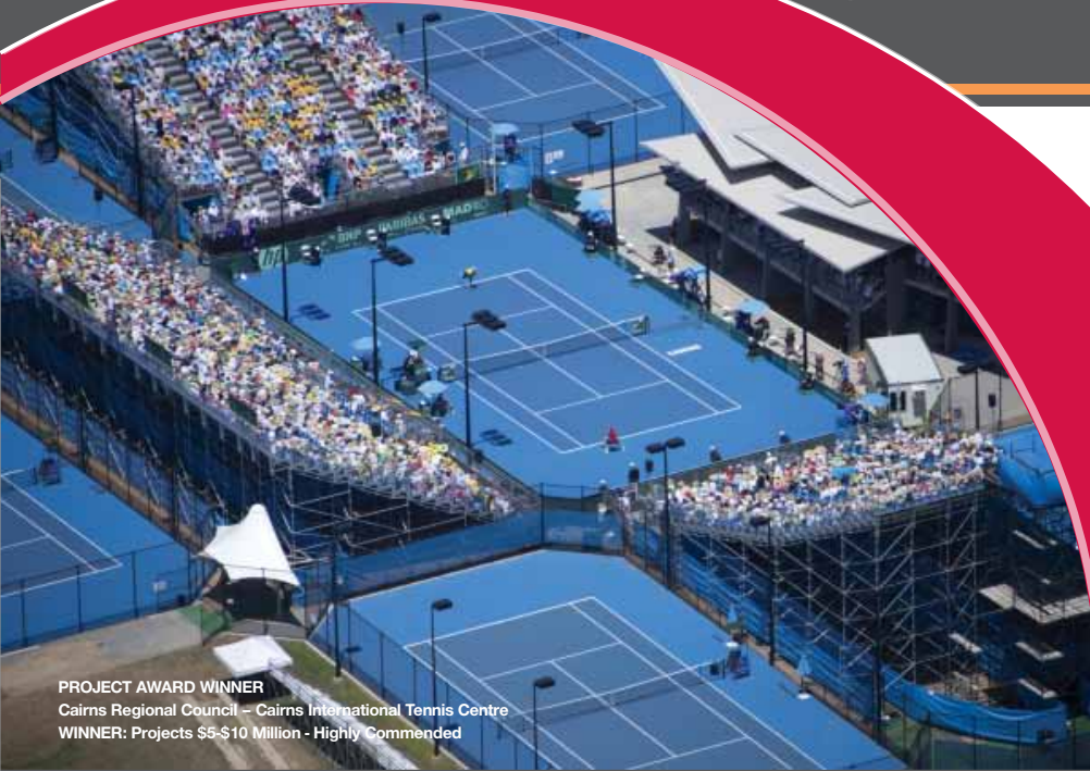
PROJECT AWARD WINNER Cairns Regional Council – Cairns International Tennis Centre WINNER: Projects $5-$10 Million - Highly Commended